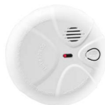
WS588P Wireless Smoke Detector