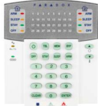
K32RF* 32-Zone Wireless LED Keypad