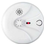
WH588P Wireless Heat Detector