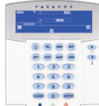
K37* 32-Zone Wireless Fixed LCD Keypad