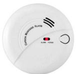
WC588P Wireless Carbon Monoxide Detector